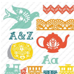
Folk Art Festival Cartridge