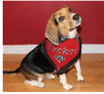
Valentine Doggie Bandana