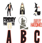
A Frightful Affair Cartridge