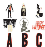
A Frightful Affair Cartridge