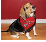
Valentine Doggie Bandana