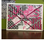
Easy DIY Bulletin Board.