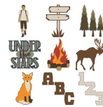
Outdoor Man Cartridge