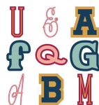
Extreme Fonts Cartridge