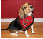
Valentine Doggie Bandana