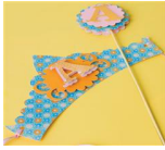
Princess Crown & Wand