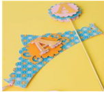
Princess Crown & Wand