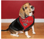
Valentine Doggie Bandana