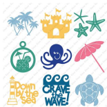
Life is a Beach Cartridge