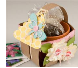
Floral Berry Basket