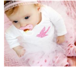
Bird Baby Sleeper