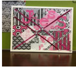
Easy DIY Bulletin Board.