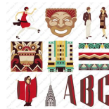
Art Deco Cartridge