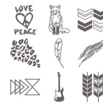
Cricut® Project Cartridge, Boho Graphics Iron-on