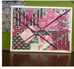
Easy DIY Bulletin Board.