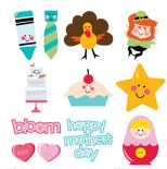
Simply Charmed Cartridge