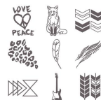
Boho Graphics Iron-on Cartridge