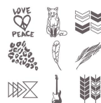
Boho Graphics Iron-on Cartridge