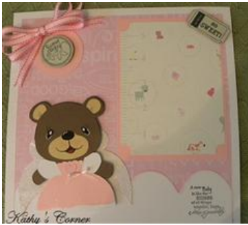
Scrap book layout for Baby Girl

I used Cardz Tv Stamps set Ticket Talk 2 to stamp the ticket and sentiment. I used my favorite ink Memento Tuxedo Black Ink. I also stamped the Anew Baby sentiment on gray paper with Rubbernecker Stamps and then the Sweet baby with a stamp set I am not sure of the name.