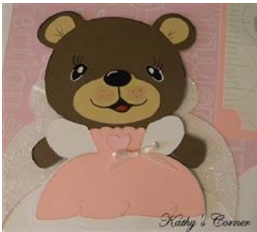
Cricut Cartridge Teddy bear Parade

I cut the Bear and all of its pieces at 5.5 and put together with the Quick Dry Adhesive. The wings were cut from plain white card stock and then I added fine white glitter. I used a black marker to add mouth and I used a white gel pen to add white parts to the face.