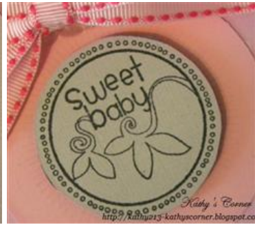
Stamped with Memento Tuxedo Ink