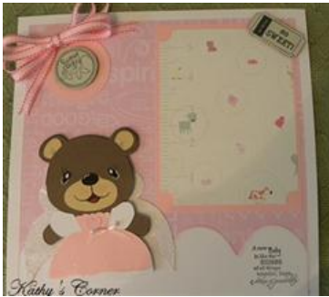
Scrap book layout for Baby Girl

The white background edging was from Martha Stewart Elegant Cake Art cut at 3.88 and I welded 2 of them together after I removed the circle in the original border. I did this all on my Gypsy.