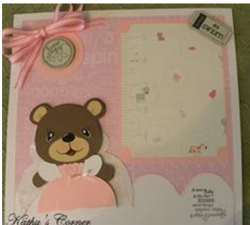
Scrap book layout for Baby Girl

I cut a 5"x7" Pattern Baby paper for the picture background. I used my ATG to add this to my layout.