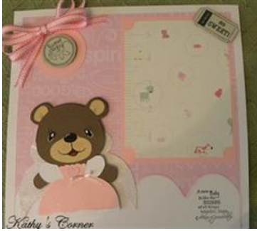
Scrap book layout for Baby Girl

I used a textured 12" X 12" Card Stock for the base of my layout. Then I added a piece of pattern pink paper. I cut it at 11.5" x 11.5".