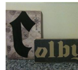
Pirate Name plaque