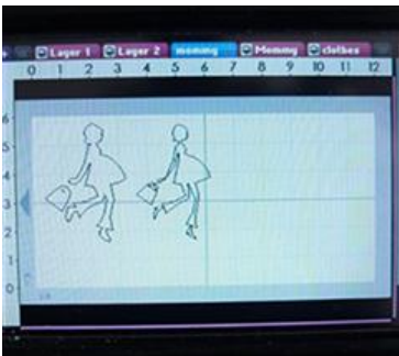
Mommy and shadow

Place blackout on the Gypsy mat. Then place a shadow on the mat. Size up the shadow until you are satisfied that there is a wide enough border around the image. Cut mommy from white cardstock, and shadow from teal pearlized CS.