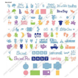
New Arrival Cartridge