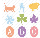
Cricut® A Child's Year Cartridge