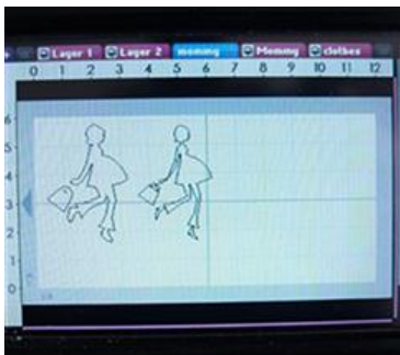
Mommy and shadow

Place <mommy> blackout on the Gypsy mat. Then place a shadow <mommy> on the mat. Size up the shadow until you are satisfied that there is a wide enough border around the image. Cut mommy from white cardstock, and shadow from teal pearlized CS.