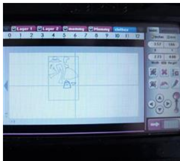
Outfit on Gypsy

Place <mommy-s> for outfit on mat. Place cardstock/paper of various colors and prints on the mat. Now HIDE all parts you do't want to cut at once. (e.g., to cut pants -- hide hair, top, hat, purse, shoes). Continue cutting in this manner, hiding parts you don't want cut out of THAT color. For the shoes, I opted to paint them on rather than fuss with the tiny shoe pieces.