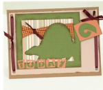
"6 Today" Card