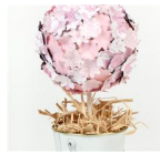
Mother's Day Centerpiece