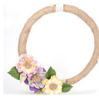
Mother's Day Wreath