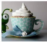
Tea Cup Cupcake Holder