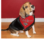
Valentine Doggie Bandana