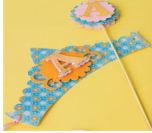
Princess Crown & Wand