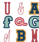
Extreme Fonts Cartridge