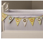
Welcome Crib Banner