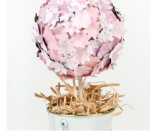
Mother's Day Centerpiece