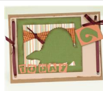
"6 Today" Card