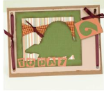
"6 Today" Card