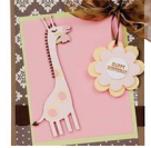
Happy Birthday Card - Giraffe