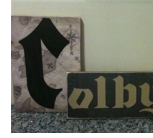
Pirate Name plaque