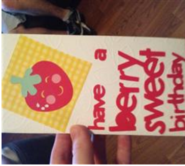
Have a Berry Sweet Birthday

Give your ADORABLE card to the sweet birthday girl! :)