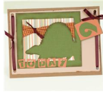
'6 Today' Card