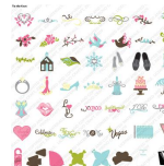
Tie the Knot Cartridge