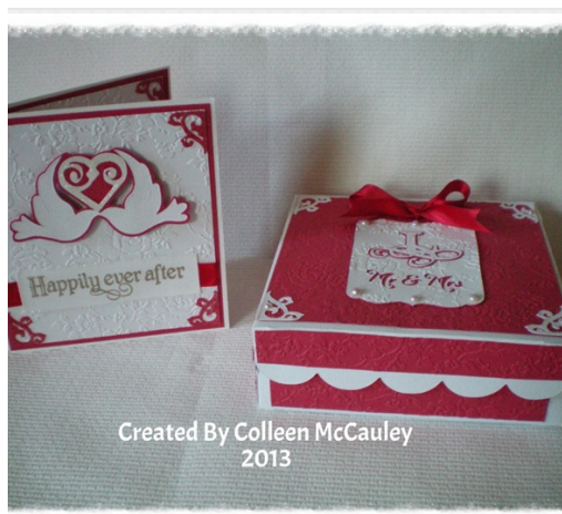
Created By Colleen McCauley 2013