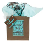
Gate Gift Bag