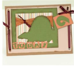
'6 Today' Card