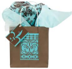
Gate Gift Bag