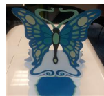
Butterfly Display card