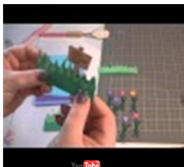
making the card video