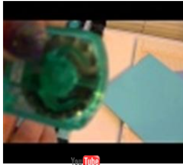
video using paper cutter