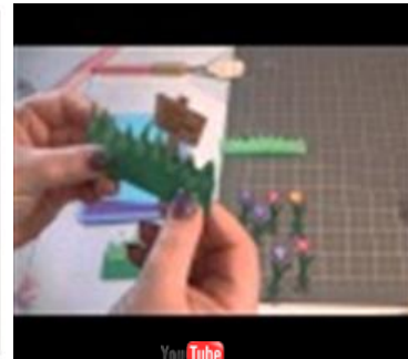
making the card video