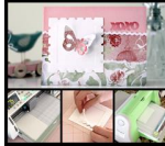
Butterfly Kisses Card