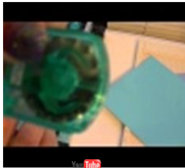
video using paper cutter