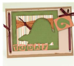
"6 Today' Card