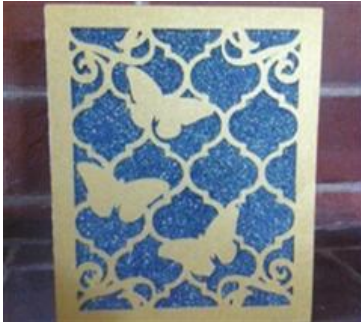
Little Butterflies card

Step 6: I made the engagement congratulations card in the same way as the butterfly cards, but instead of butterflies I added birds and the word congratulations.