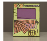
BOO! Halloween Frame