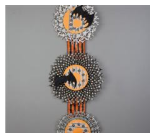
Boo Rosette Wall hanging