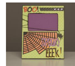
BOO! Halloween Frame