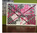
Easy DIY Bulletin Board.