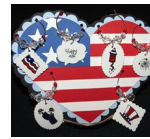
Fourth of July Glass Charms