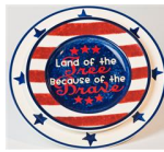
Land of the Free Plate