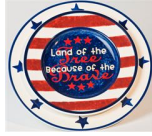
Land of the Free Plate