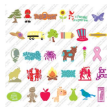
Cricut® Ultimate Creative Series