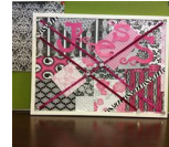
Easy DIY Bulletin Board.