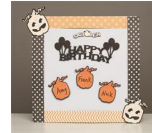
Magnetic Birthday Board