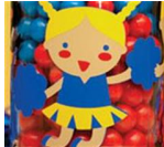
Gum Ball Jar