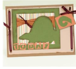
"6 Today" Card