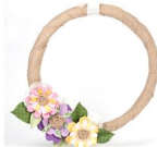
Mother's Day Wreath