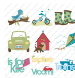
Nate's ABCs Cartridge