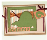
"6 Today" Card