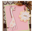
Happy Birthday Card - Giraffe