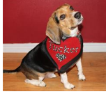
Valentine Doggie Bandana